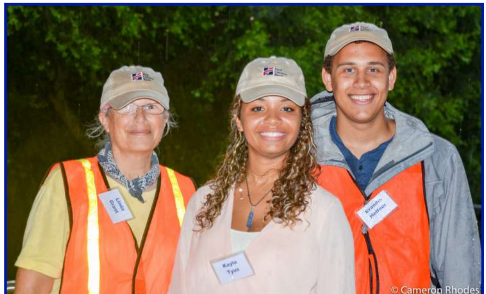
Parking Volunteers at I Love Edisto Cocktail Party