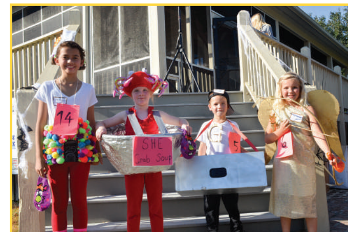
Children's Costume Contest winners: a gumball machine, a bowl of she crab soup, a DJ, and a golden cupid

They have an application, review and approval process for our fellow Edisto residents to request assistance. To contact the Edisto Island Home Mission Team, send an email to edistomissionteam@yahoo.com .