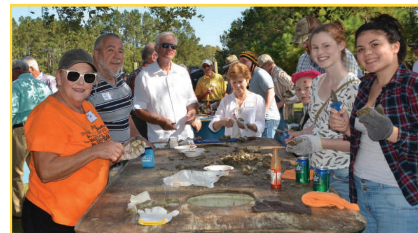
Enjoying oysters and great weather!