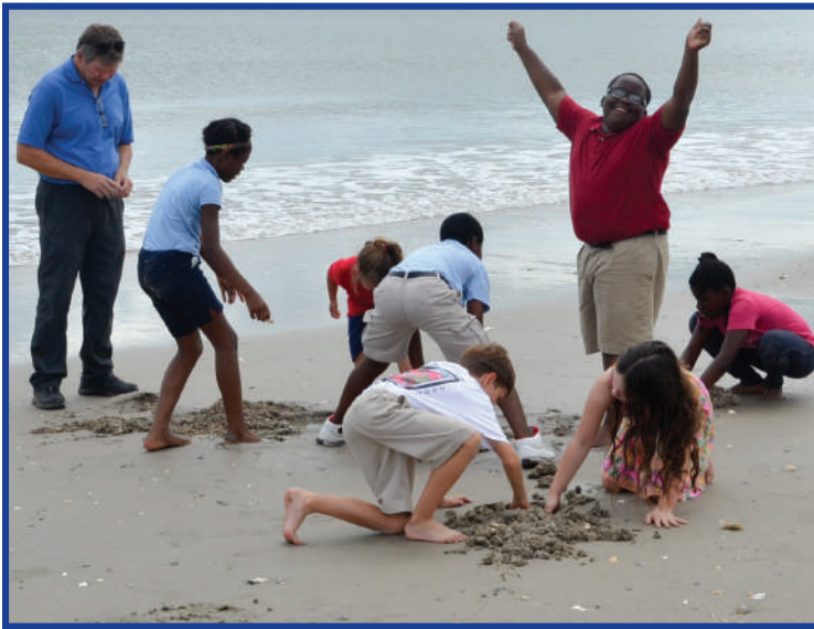
Young Naturalist Club at Edisto Beach State Park.

The second year of the Young Naturalist Club is well underway. Thanks to immense support from members like you, thirteen students from Jane Edwards Elementary School have been exploring Edisto's natural environment through the lenses of the many people and organizations that work to conserve the island and its wildlife. The Young Naturalists have already taken on the roles of wildlife rehabilitators, sea turtle biologists, and ornithologists. Their next adventure will take them to the beach, where they will each be wildlife photographers for the day. Your generosity and dedication affords each of these students a window to their future. Today's Young Naturalists might just be the shark biologists, climate scientists, and beekeepers of tomorrow.