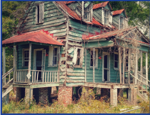
Hutchinson House 2017

In case you haven't heard, we bought the historic Hutchinson House! So why would a land trust do that? The Edisto Island Open Land Trust borrowed $100,000 from the Coastal Community Foundation's Conservation Loan Fund, and purchased the Hutchinson House and ten surrounding acres in the fall of 2016, with the intent of protecting the land and the home. This has been widely received as an extremely worthy project, but historic building restoration isn't exactly our expertise. Why are we, a land trust, venturing into this project? Because it isn't just about the house. It's about the land the house stands on, and the people who owned, lived and worked on that land. It is impossible to separate the natural history and ecology of Edisto Island from the story of land ownership on the island. The remarkable account of the original land and homeowner is an important part of Edisto's heritage.