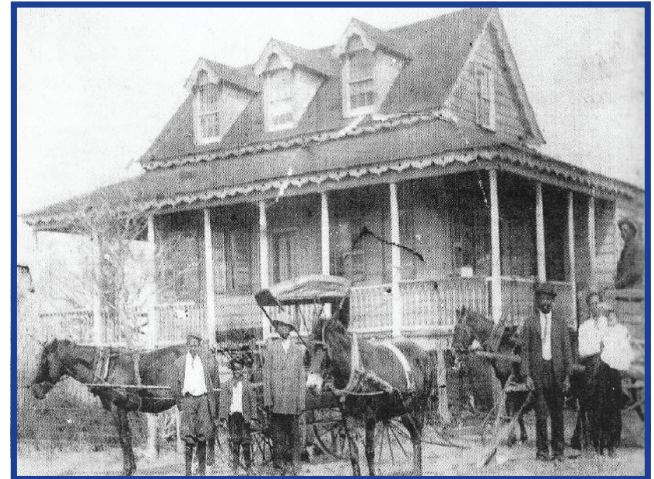
Hutchinson House 1900