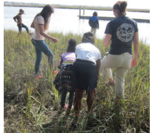
Searching for animals that could be affected by climate change

This year our theme is “Water, Water, Everywhere”. We will explore the Edisto watershed, learn about water quality, test saltwater and freshwater areas on our island and investigate how water quality affects humans and animals where we live. Studying the impact of plastics in our oceans is also of major importance as we grow our next generation of Citizen Scientists.