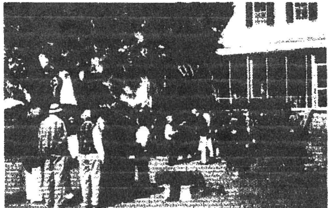
"EIOLT members and guests enjoy an afternoon together learning more about the significance of preserving land."

The meeting was a great success. The land trust gained a number of new supporters after the event. Their support will be used to continue the trust's goals of preserving the scenic views and vistas of Edisto Island. Plans are underway for the 1997 meeting. The meeting has been scheduled for a Saturday afternoon in October. More information will be provided as the date approaches.