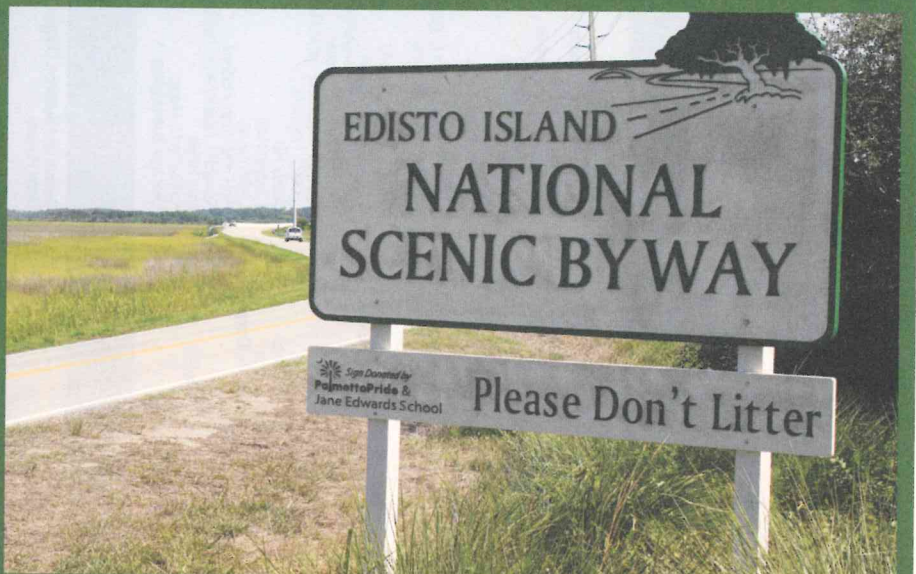
Gateway sign at the entrance to the Edisto Island National Scenic Byway

Have you noticed the new Edisto Island National Scenic Byway sign? It's nestled in wax myrtles on the side of the road as you approach the Dawhooer Bridge coming onto Edisto Island. After months of working on the design, EIPA (Edisto Island Preservation Alliance) has installed the gateway sign in its new home! Funds for the sign were donated by the Jane Edwards School, which was awarded a Palmetto State grant for the purpose of enhancing the scenic byway and encouraging the public to keep the corridor litter-free. Other news along the Edisto Island National Scenic Byway -- work begins soon on repairing the bridges over Sand Creek, Russell Creek, Store Creek, and EIOLT was recently awarded special recognition by the Governor's SC Scenic Highway Committee for its leadership in attaining the final designation for Highway 174. ■