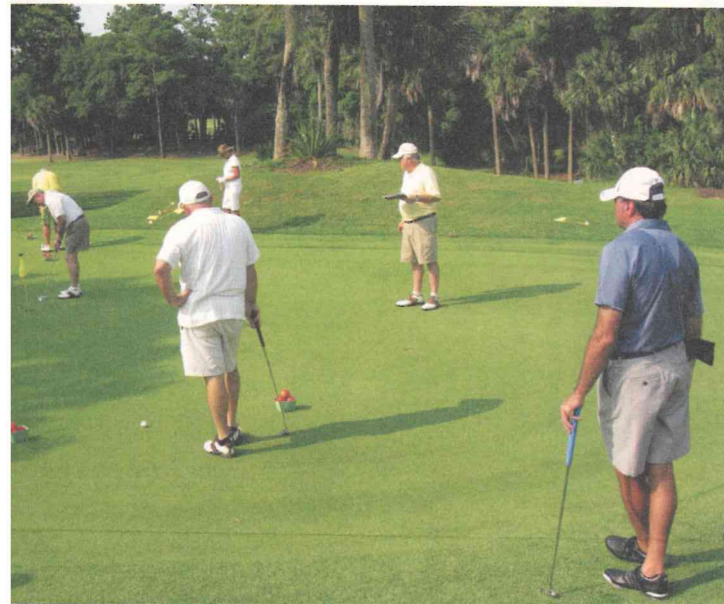
Players putting around tomato baskets on the green

"Seeds" have already been planted for next year's Tomato Open, and details will follow as soon as the plans "ripen."