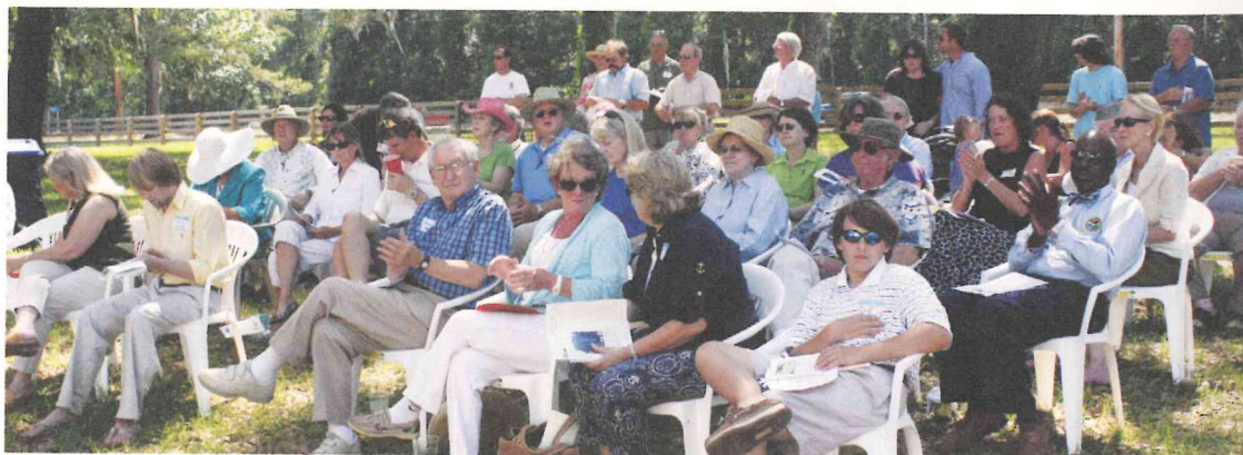
EIOLT Members gather at Dedication to honor those for whom Legacy Live Oaks were planted in 2010