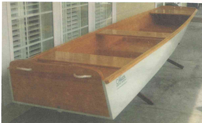
The Edisto Bateau ready for auction