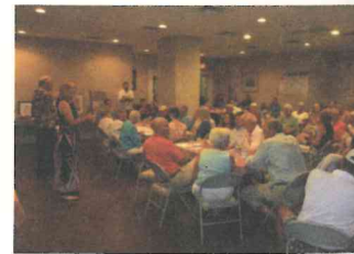
The bidding begins at the Tomato Open Live Auction.

Sixty golfers comprising 15 teams competed in tournament play on Saturday, May 15 at the Plantation Course at Edisto. The winning team in the "A" flight was defending champion, "Hackin' Dogs". "B" flight winners were the EIOLT sponsored team, "The Green-Keepers".