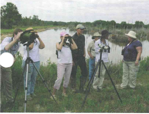
Back to Nature birding excursion.