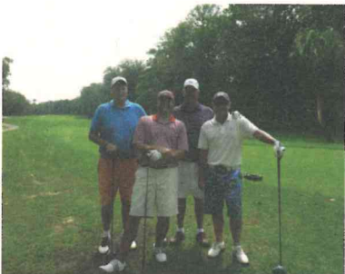
2011 Tomato Open "A" Flight winners, the "Hackin' Dogs".