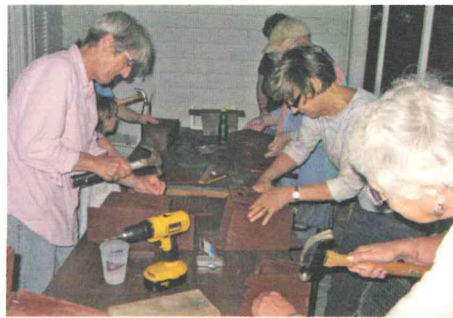
Blue bird nesting boxes under construction

On March 24 a seminar on "Blue Bird Box Building" was held at historic Sunnyside Plantation. Carroll Belser led the group with a discussion about the rapidly declining habitat for the Eastern Blue Bird. Materials for constructing nesting boxes were provided and attendees then constructed their own boxes.