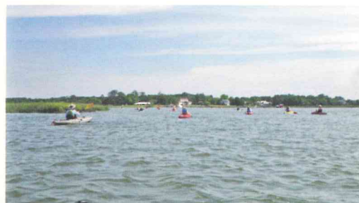
A kayak view of Store Creek