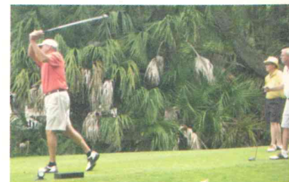
2011 Tomato Open participant

Admission to the cocktail party and auction is $20.00 per person. Entry for the golf tournament is $125.00 per person or $500.00 per team.