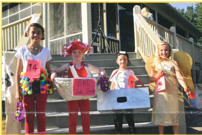
Children's Costume Contest winners: a gumball machine, a bowl of she crab soup, a DJ, and a golden cupid

They have an application, review and approval process for our fellow Edisto residents to request assistance. To contact the Edisto Island Home Mission Team, send an email to edistomissionteam@yahoo.com .