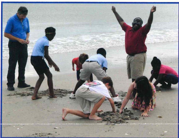
Young Naturalist Club at Edisto Beach State Park.

The second year of the Young Naturalist Club is well underway. Thanks to immense support from members like you, thirteen students from Jane Edwards Elementary School have been exploring Edisto's natural environment through the lenses of the many people and organizations that work to conserve the island and its wildlife. The Young Naturalists have already taken on the roles of wildlife rehabilitators, sea turtle biologists, and ornithologists. Their next adventure will take them to the beach, where they will each be wildlife photographers for the day. Your generosity and dedication affords each of these students a window to their future. Today's Young Naturalists might just be the shark biologists, climate scientists, and beekeepers of tomorrow.