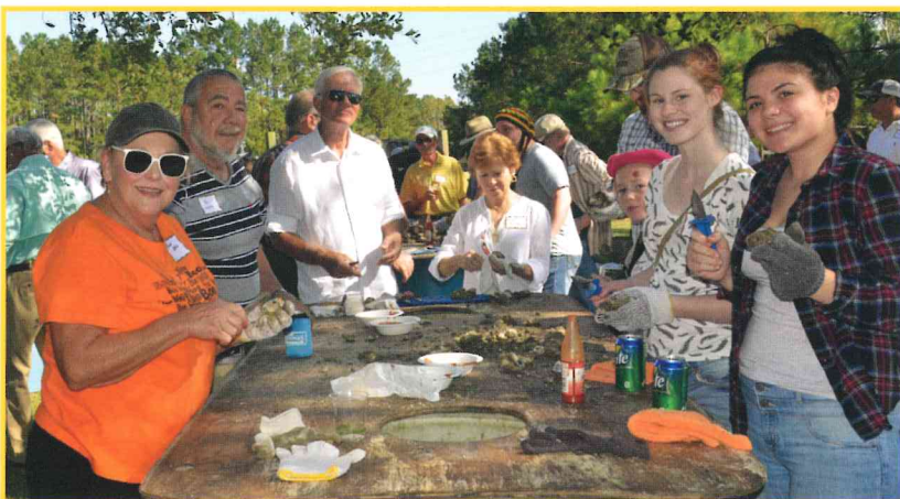
Enjoying oysters and great weather!