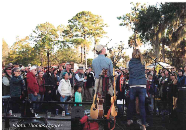
The "Heads or Tails" raffle was a big hit and raised over $1,200!