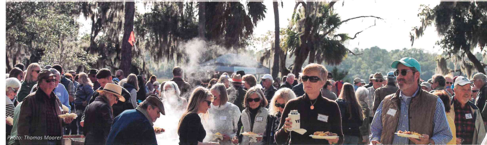
This year's crowd was the largest ever, with over 600 attendees who came out to celebrate all the conservation work we have achieved together on Edisto.