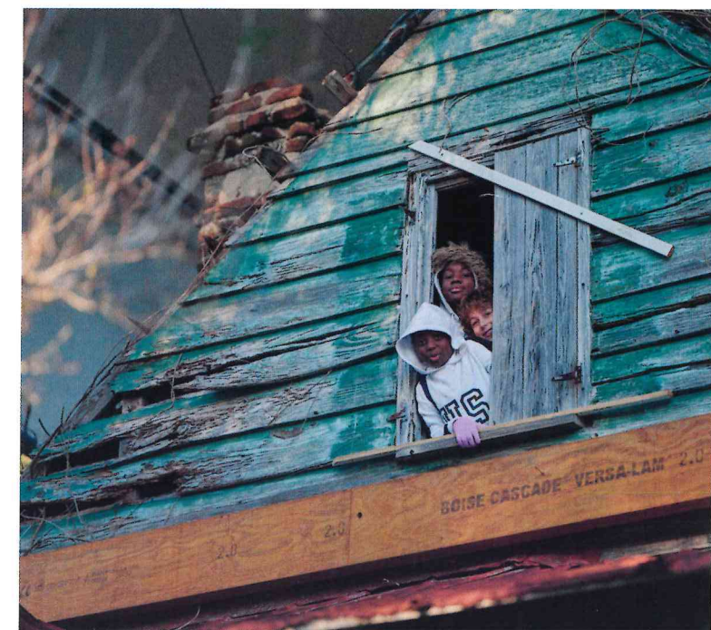
Children peer out of an upper window in the Hutchinson House during a field trip prior to restoration.